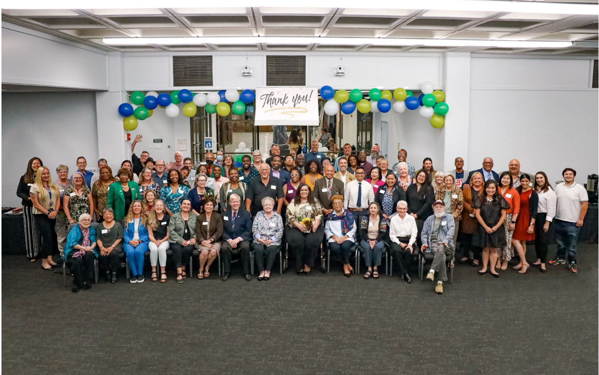
Annual Commissioner Recognition Event

Based on the findings thus far, MRG is recommending reducing the number of BCCs from 19 to 14. These recommendations could be further informed by community input and Council discussion at the Study Session. Any material changes to the BCCs should ideally be implemented in a manner that allows time for Commissioners on BCCs slated to be either consolidated or eliminated, to transition to another BCC where possible or to serve for up to a 12-month period of their current BCC term.